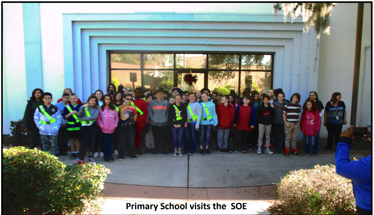
Primary School visits the SOE

When we visit high school students they can pre-register to vote and once they turn 18 their voter cards are mailed to them.